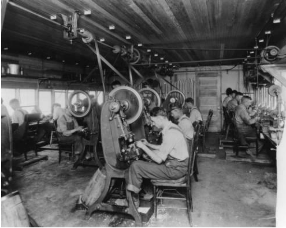
Baldwin Radio Factory 1922